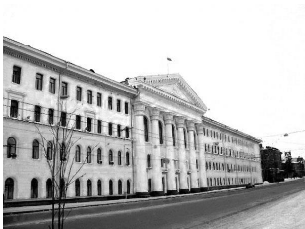
The mail building of TUSUR