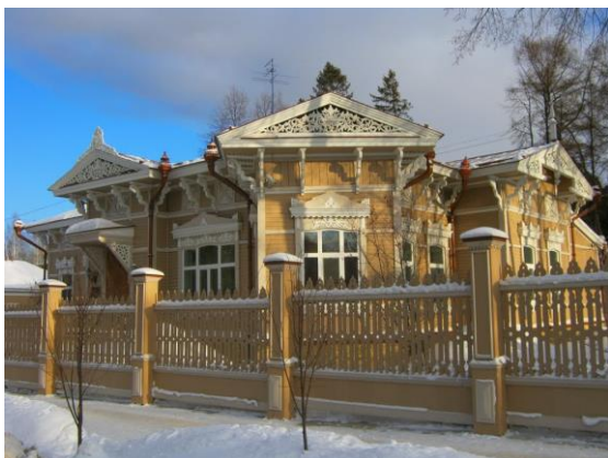
Wooden architecture of Tomsk. Belinskogo str. 72

Tomsk is a city and the administrative centre of Tomsk Oblast, Russia. It is located on the River Tom. It is one of the oldest towns in Siberia.