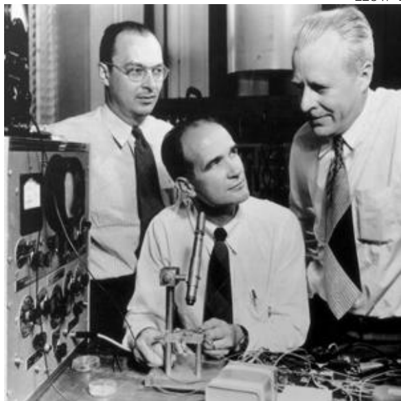
The Bell Labs team of John Bardeen, Walter Brattain and William Shockley won the 1956 Nobel Prize in Physics for their work in developing transistors.